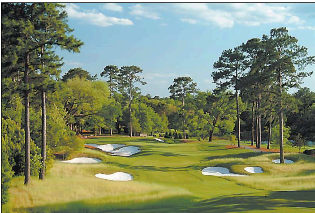
Caledonia Golf & Fish Club - Hole 6

Hilton Head: Daufuskie Island Resort Melrose Course; *May River Golf Club at Palmetto Bluff, Bluffton; Palmetto Dunes Resort, Arthur Hills Course; Sea Pines Resort Harbour Town Golf Links.