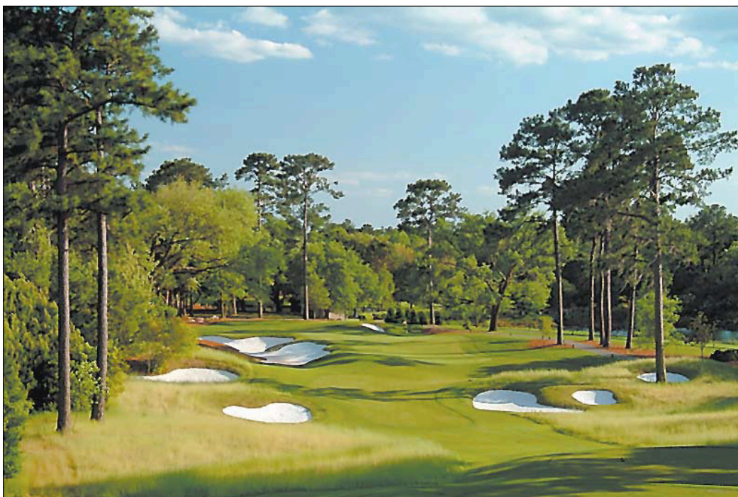
Caledonia Golf & Fish Club - Hole 6

Hilton Head: Daufuskie Island Resort Melrose Course; *May River Golf Club at Palmetto Bluff, Bluffton; Palmetto Dunes Resort, Arthur Hills Course; Sea Pines Resort Harbour Town Golf Links.