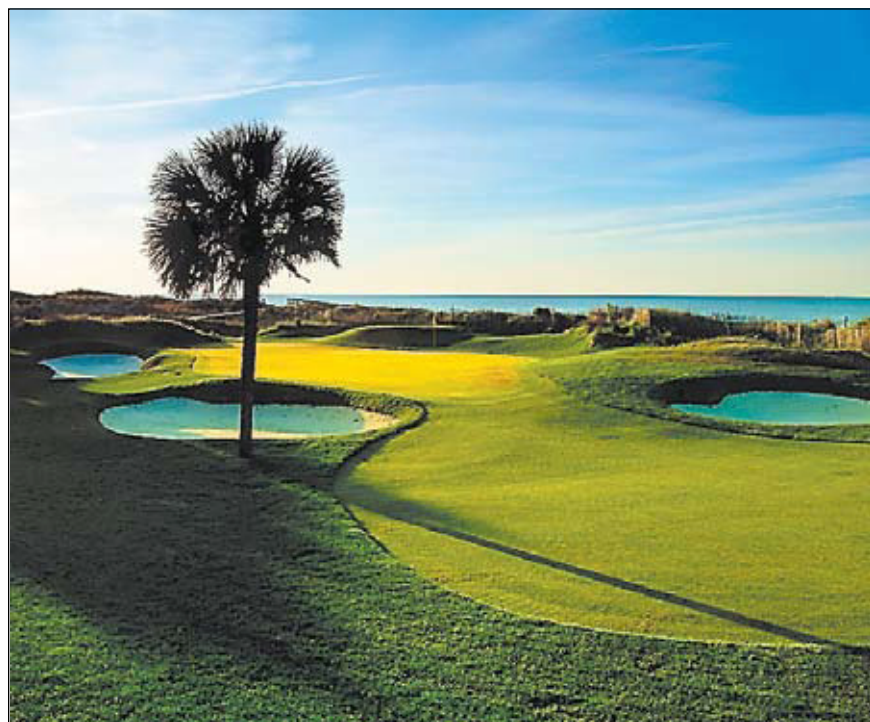
Kiawah island Resort - Turtle Point Hole 14

The objective is to promote excellence in golf course design and operations through competitive rankings, education and public advocacy. The Panel serves as an ambassador for golf in South Carolina by striving to stimulate and facilitate the promotion and marketing of the outstanding golf courses, resorts, and real estate developments.